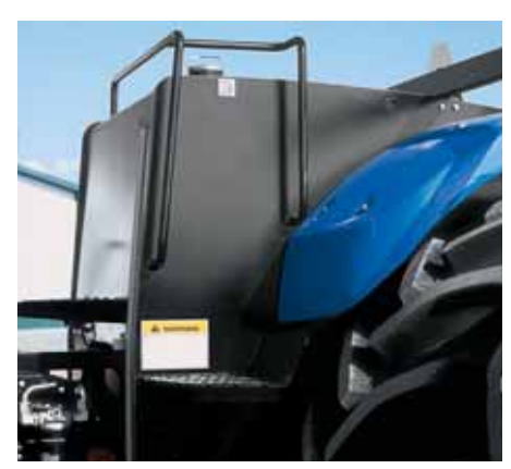
A large-capacity fuel tank is integral with the rear frame to keep refueling to a minimum — and your productivity to a maximum. A 1,138 litre fuel tank standard on large-frame T9000 models, while a 758 litre tank is standard on small-frame units.

A unique "center-pull" design allows T9000 4WDs to deliver power where it counts — at the drawbar. The drawbar is mounted near the articulation point at the center of the tractor, giving T9000 tractors a better pull angle for more efficient pulling power to tow wider/heaver implements.